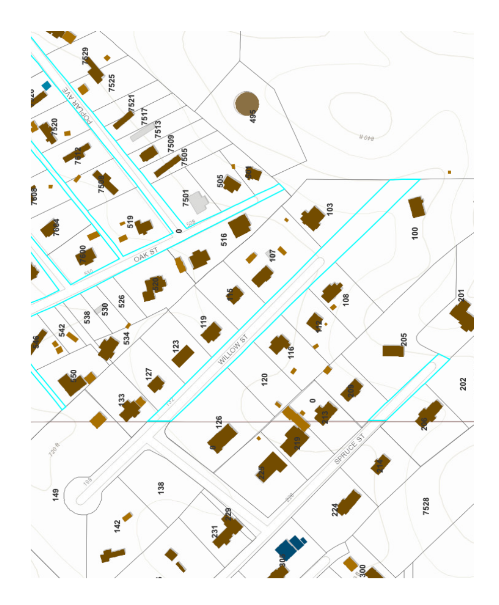
Current Tax Map